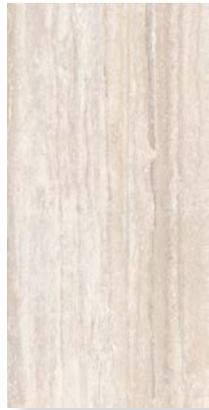
Bianco Al Contro