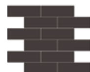
Brick 03 Mosaic