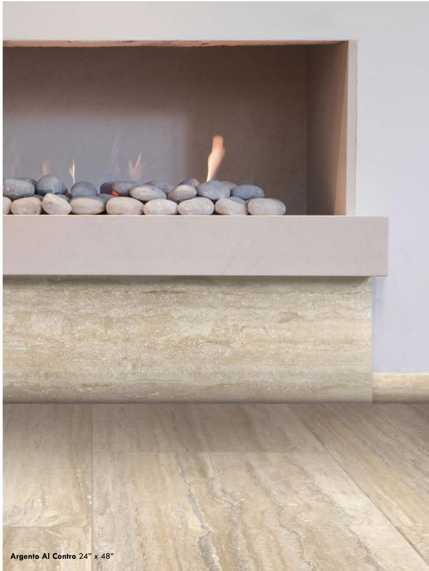
Argento Al Contro 24" x 48"