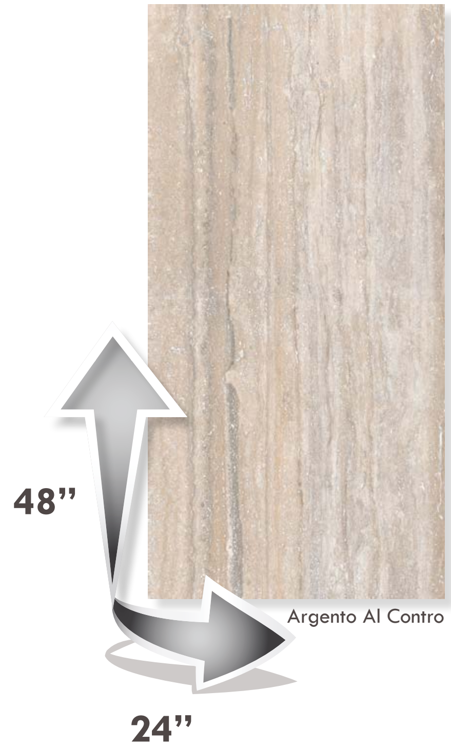
Argento Al Contro