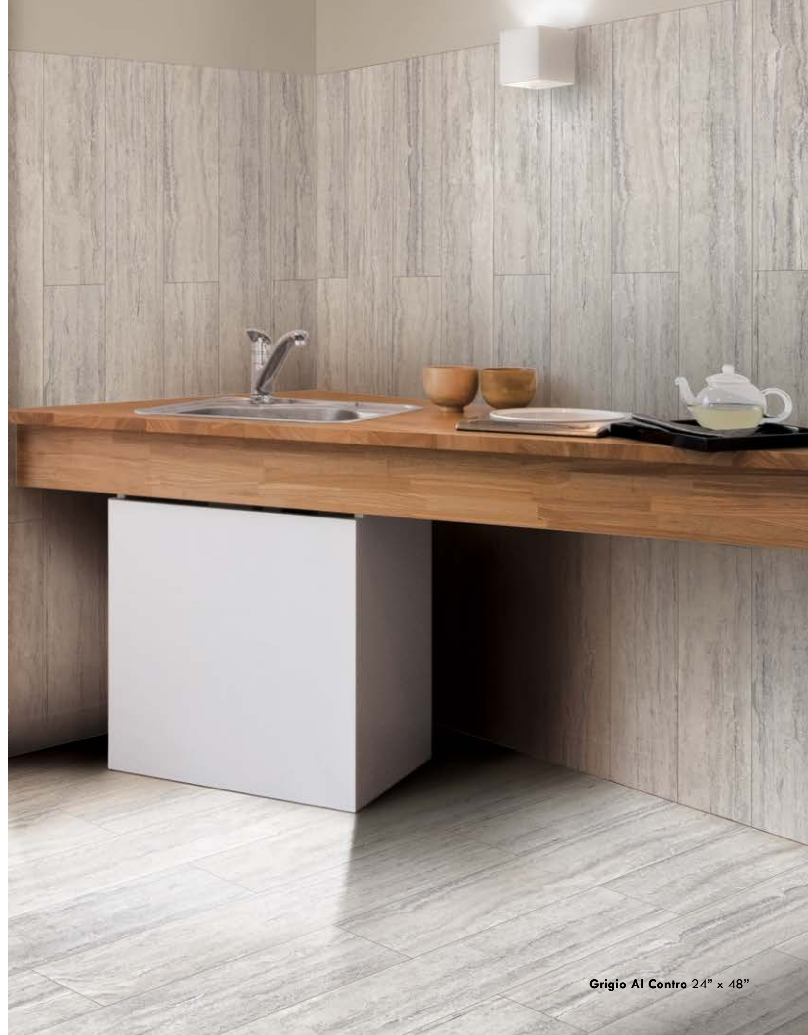
Grigio Al Contro 24" x 48"