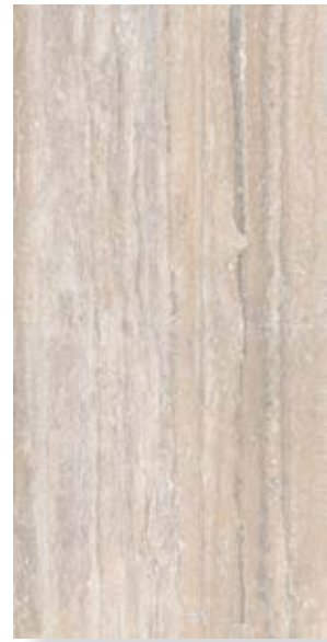
Argento Al Contro