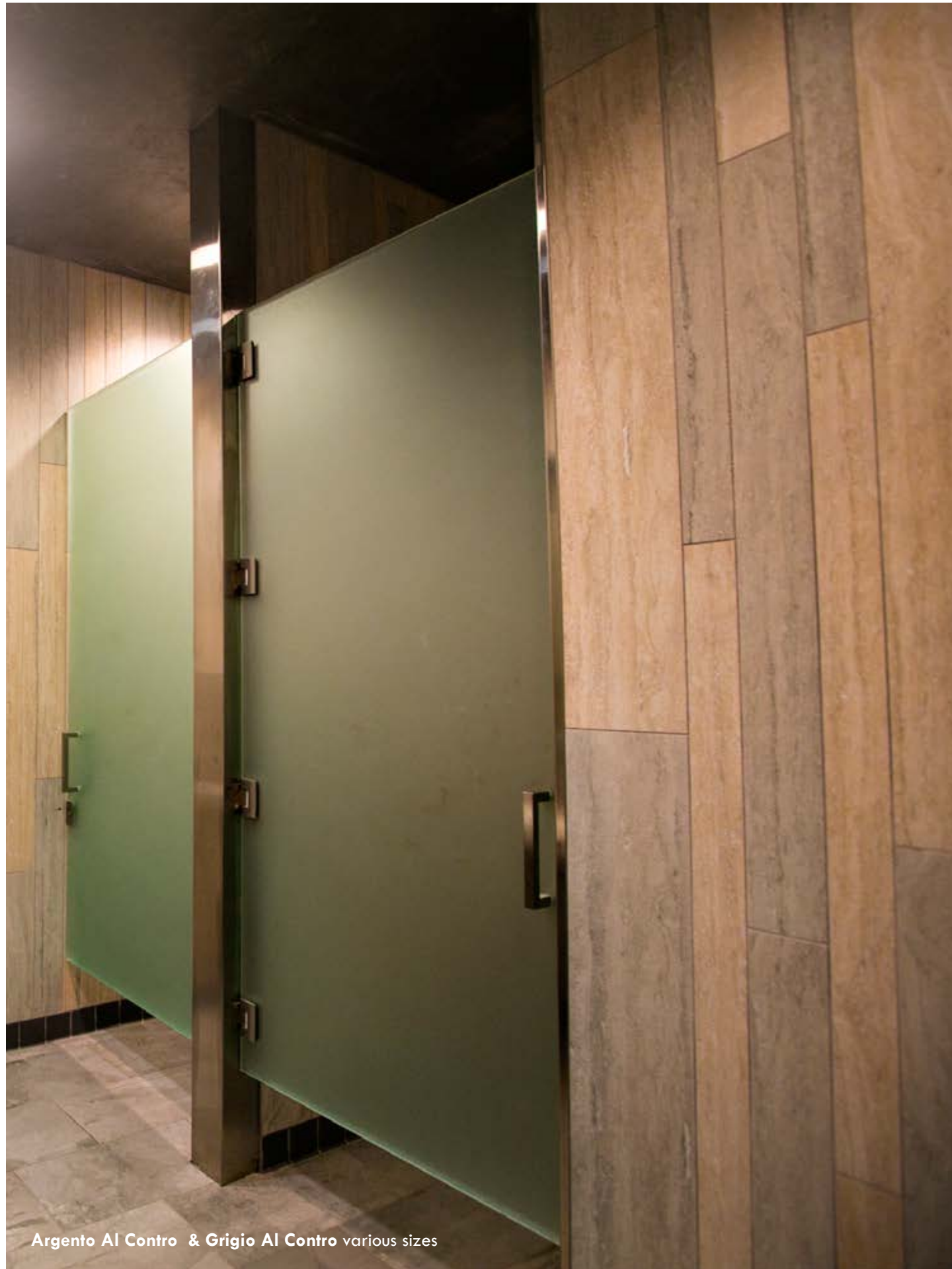
Argento Al Contro & Grigio Al Contro various sizes

C1028 COF Dry ≥ 0.75 Wet ≥ 0.60 Acutest DCOF Wet ≥ 0.42