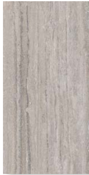
Grigio Al Contro