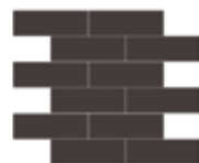
Brick 03 Mosaic